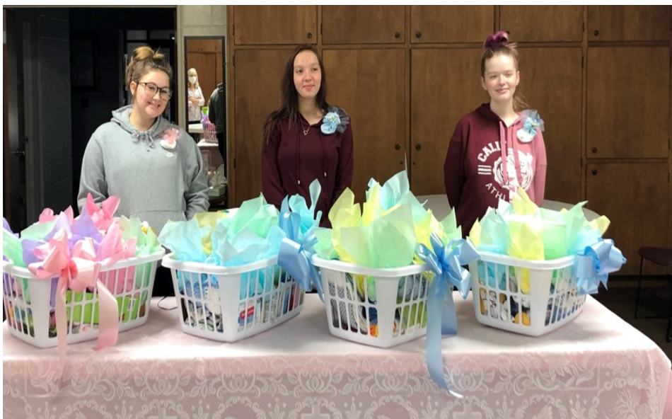
On Tuesday, November 16, the Agape Circle hosted a Baby Shower for three moms as part of the Teen Parent Program. They were excited to receive their baskets full of gifts.