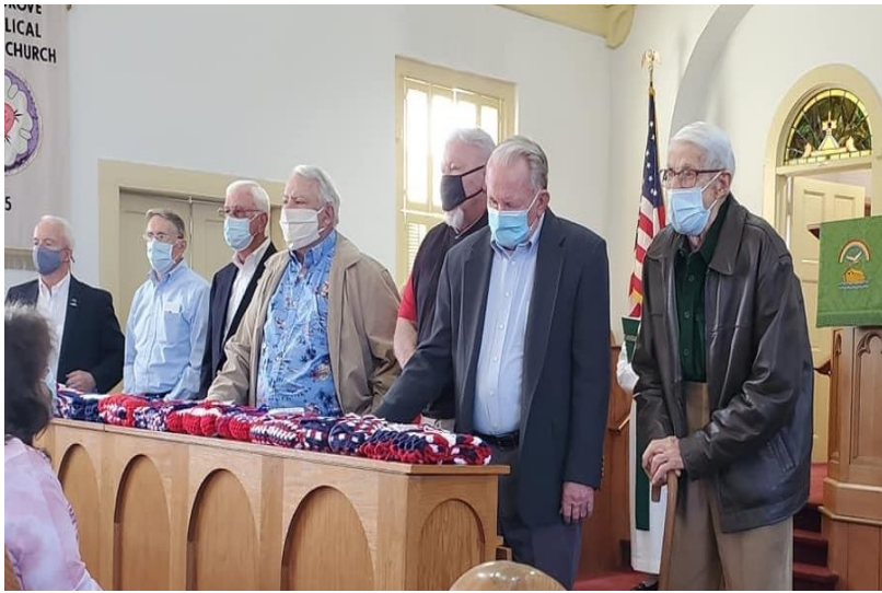
On Sunday, November 7, we honored the Veterans of Holly Grove Lutheran Church. The Fellowship Committee sponsored the making of red, white, and blue lap blankets which were given to each Veteran.