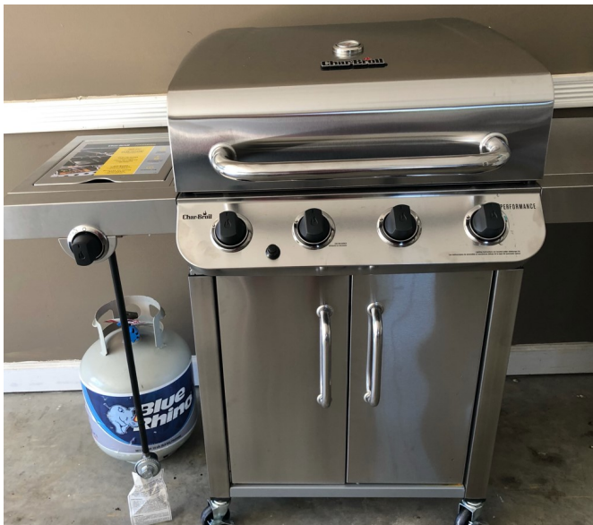
With gifts of donations, Ty was able to purchase a new gas grill for the Picnic Shelter.