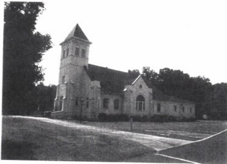
And Holly Grove Lutheran Church today.....2021