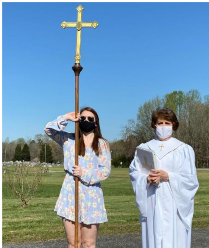
Easter Sunday At Holly Grove