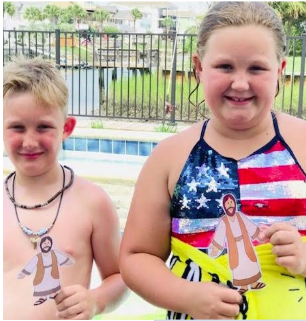
Flat Jesus traveled to Cherry Grove / North Myrtle Beach!