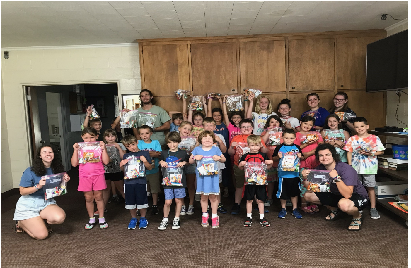
Camp Lutheridge 2019 was a success!