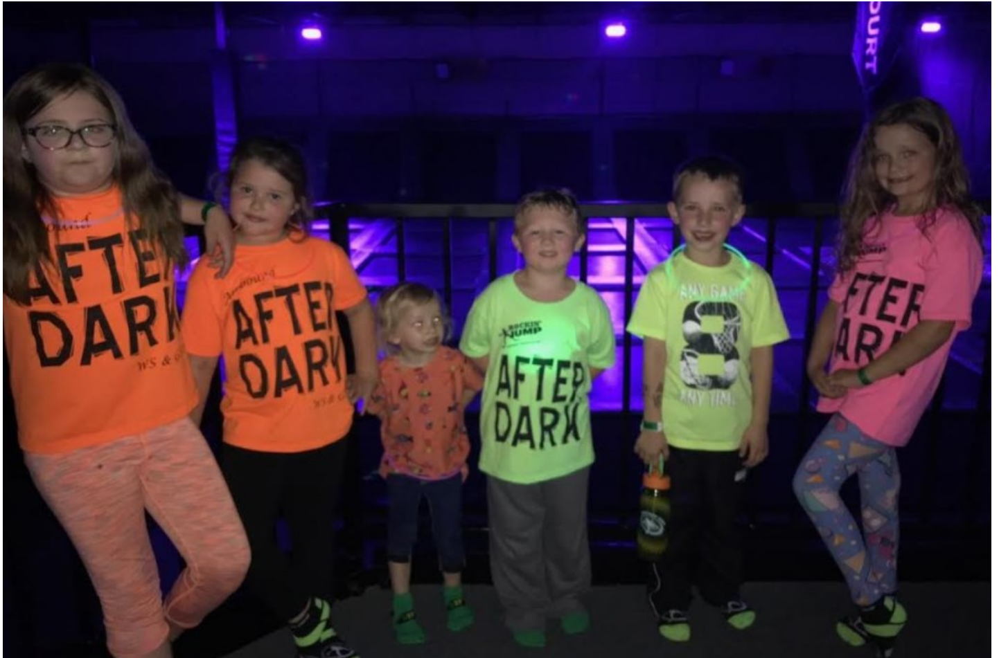
SILLY Youth—"Rockin' Jump After Dark!