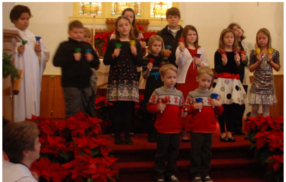
Youth Hand Bell Choir Performs the Prelude